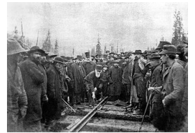
Click photo for enlargement

1885 to travel by train from the Atlantic to the Pacific and remain for the entire distance in Canada on the Canadian Pacific Railway (CPR), without having to cross the border into the USA and travel by the older American Transcontinental Railroad completed in the 1860s. Without that railway link between Eastern Canada and the Pacific West, the western half of Canada would almost certainly have defaulted to the more powerful economy and much larger population of the United States, already an established nation since 1776. Thanks to Sir John and his colleagues we have our own country that now proudly welcomes everyone to share our good fortune of living in one of the world's most stable nations.