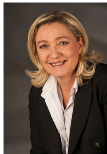
Marine Le Pen

The 48 year old Ms Marine Le Pen, a lawyer, is no stranger to politics. She is the daughter of Jean-Marie Le Pen (born 1928) who led the Front National party of France from its founding in 1972 until 2011. Ms Le Pen was elected as a member of the European Parliament since 2004 where she has had considerable influence. In 2011 she was elected to replace her father as leader of the Front National when she secured 67% of the poll. She also expelled her father and several other members from the FN when they made some controversial statements.