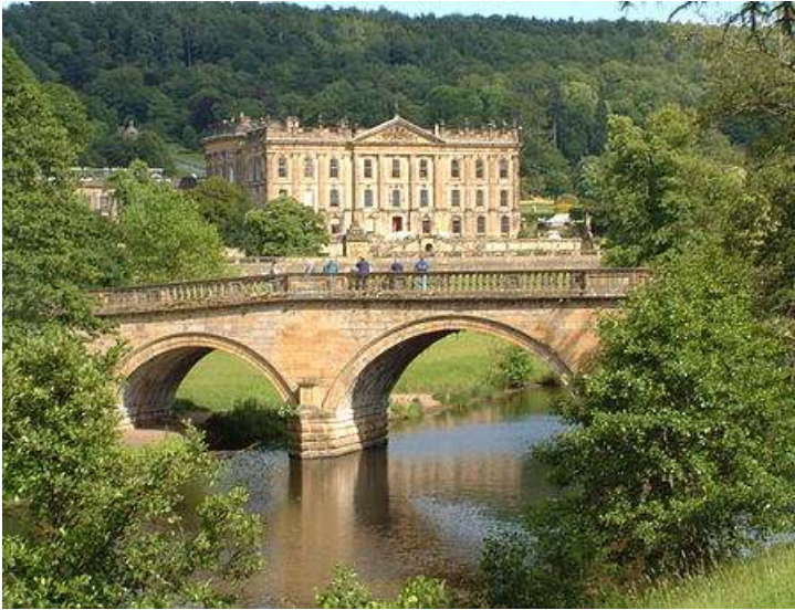
Chatsworth House, Edensor, Derbyshire, England