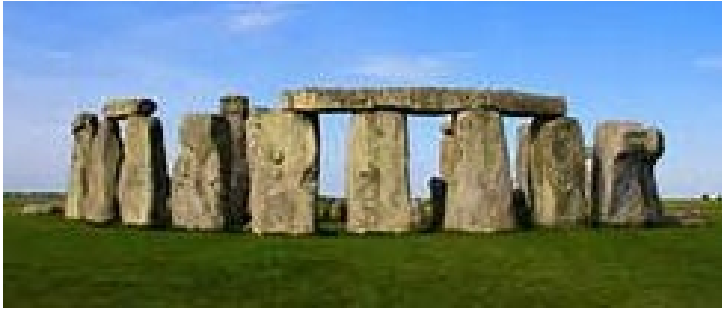
Stonehenge, Salisbury Plain, England

The famous prehistoric stone circle called Stonehenge dates from about 5,000 years ago, give or take a few. It is the most spectacular of many prehistoric stone circles to be found all over the British Isles.