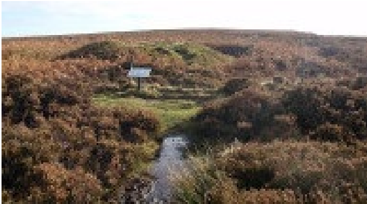
The site of Hob Hurst's House as it is today in summertime.

I recall a winter hike we took once, back in 1964, to visit Hob Hurst's House , which we had spotted as a tiny symbol on the Ordnance Survey map of the area which we always used for hiking. It was not a house, may never have been one, and no one has any idea who Hob Hurst was. It was merely a stone circle, perhaps of some ancient religious significance, situated on top of the bleak English moorland plateau above the town of Bakewell , Derbyshire, not far from the stately home Chatsworth House . It measured only about ten metres in diameter, much smaller than Stonehenge, with less than a dozen stones remaining. But as today's property merchants say, what counted was location, location, location!