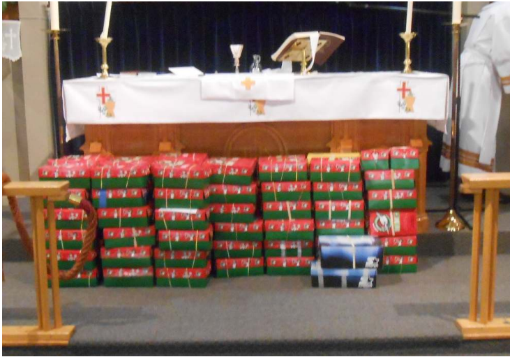
The boxes presented at St James Church on November 23 rd

Each year before Christmas members of the two churches of the Anglican Parish of Bay of Islands, St James in Lark Harbour and St Ambrose in John's Beach, organise a collection of gifts for children who otherwise might receive no gifts at Christmas time. The boxes are not actual shoe boxes, but are similar in size and decorated with Christmas motifs. Those who wish to take part make or purchase items that would appeal appropriately to children of both sexes and varying ages, and place them in the boxes. Certain requirements are applied — for example, perishable items are not permitted — and stocking stuffers like pencils, crayons, notebooks, small toys, clothing, and items appropriate for Christmas are encouraged. Simple objects are considered to be the best for countries where basic school supplies may even be too expensive for their parents to provide.