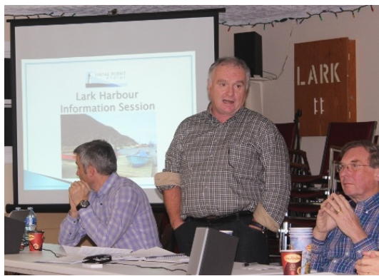
Some of the presenters at the meeting with Shoal Point Energy, the exploration company to be working here

ON WEDNESDAY 2012 NOVEMBER 14, several representatives of Shoal Point Energy along with others from various government departments involved with the oil and gas industry, visited Lark Harbour to present information about their plans for exploration of hydrocarbon-bearing rocks under the seabed along the west coast of Newfoundland. Known as the Green Point Shale formation, Lark Harbour roughly marks its midpoint. The company has licences to explore the formation which they believe is “a very large resource, with the potential to be the Hibernia of western Newfoundland.”